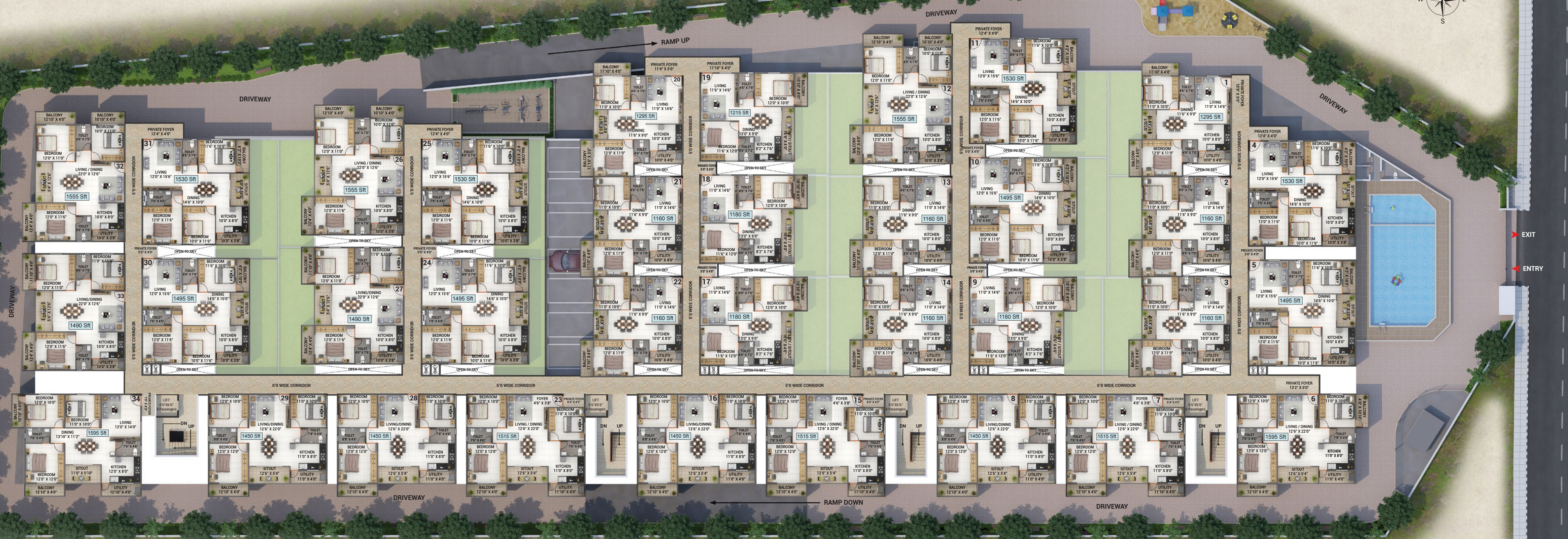
TYPICAL FLOORPLAN - 2nd, 3rd and 4th Floor